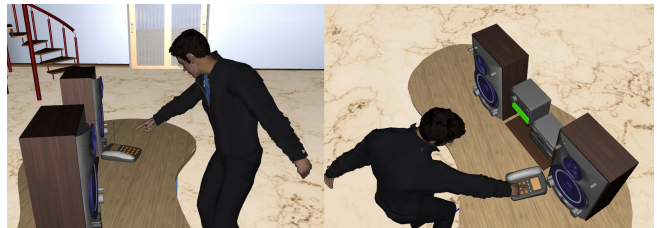
Figure 1. Example of a training application where a parameterized computational gesture model is needed in order to allow the virtual human to point to any desired feature in a given equipment and explain its function.

target virtual training. In the modeling phase, experts in the training subject could model the needed gestures and actions in a straightforward way by directly demonstrating them with motion capture devices and without the need of having previous experience with the system. In the training phase, the captured example motions are then re-used by the virtual human to train apprentice users. In particular, reproduced motions are parameterized with respect to arbitrary target locations in the environment. Figure 1 presents one typical scenario modeled by our system, where a parameterized computational gesture model is needed in order to allow the virtual human to point to any desired feature on equipment and explain its function. Our training set-up allows users to immersively interact with virtual characters in a variety of training scenarios. A full-scale immersive experience with virtual humans has the potential to improve learning in many ways, analogously to how people learn from each other. Figure 2 shows the modeling phase and training phase for pouring water actions.